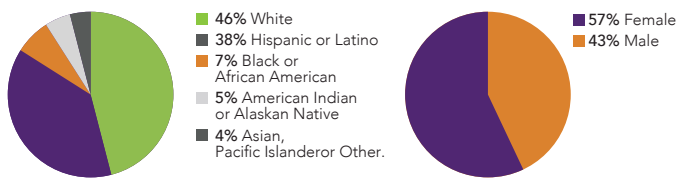
Based on full-time enrollment